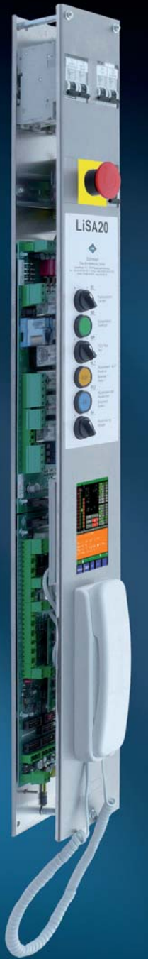
LiSA20 basic module