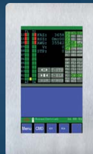
LiSA20 handheld terminal